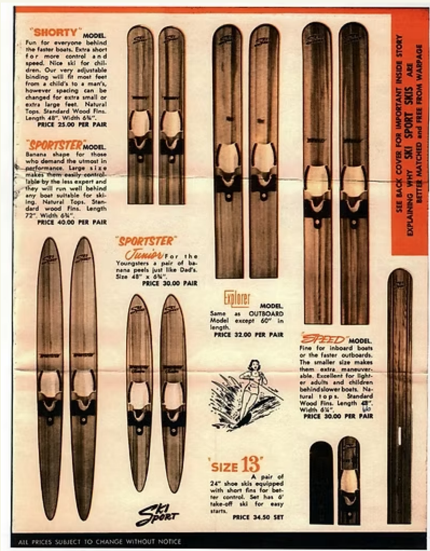
One page of a 4-page advertising spread for Derby & Ball's ski line, Ski Sport.

In 1930, the company added baseball bats to its product line and became a major supplier to teams and leagues across New England and beyond, including Major League Baseball.